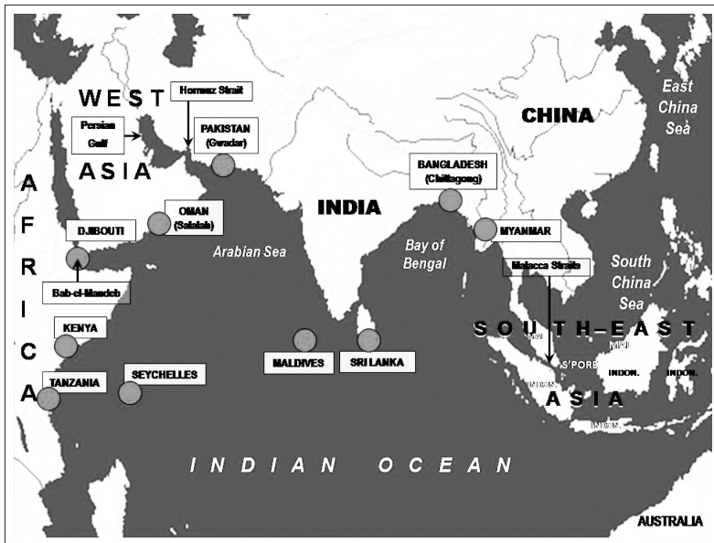
Figure 2. The ports of the 'String of Pearls' strategy, as in Khurana, 2015

One of the most pressing concerns about CPEC is a sustained Chinese military presence in Pakistan-occupied Kashmir, bringing to question that the India-China relations since the territorial disputes over a border along the Himalayas in northern and eastern India, on the Doklam plateau and in its border in Arunachal Pradesh, presents to India a perceived threat, whereas any further increase in Chinese troops along India's borders would be a serious affront to India's security (Baruah, 2018).